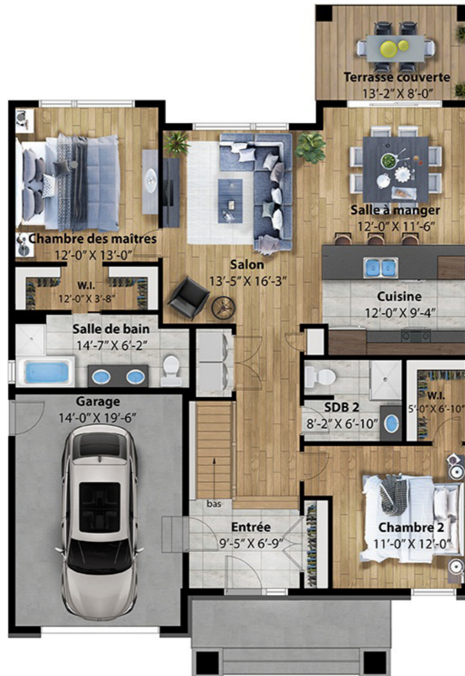
GROUND FLOOR Ground floor area : 1 356 s.f.