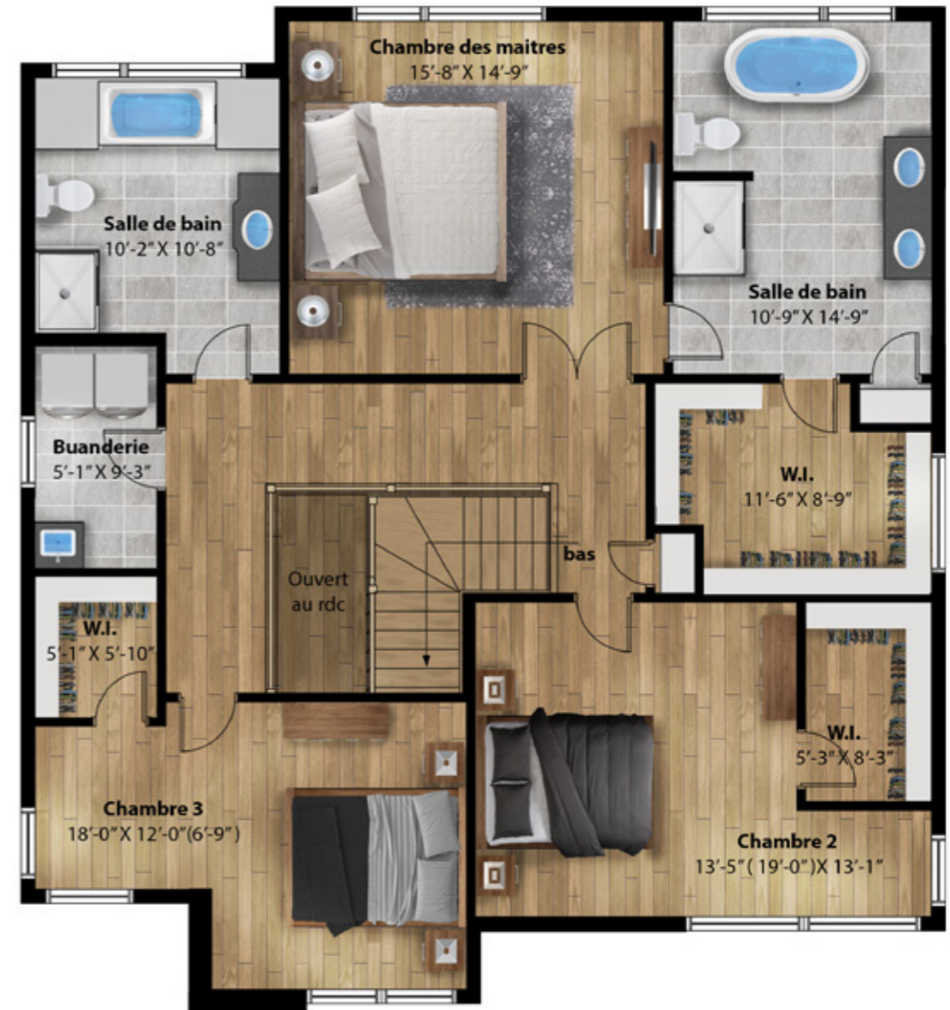
SECOND FLOOR Second floor area : 1 498 s.f.