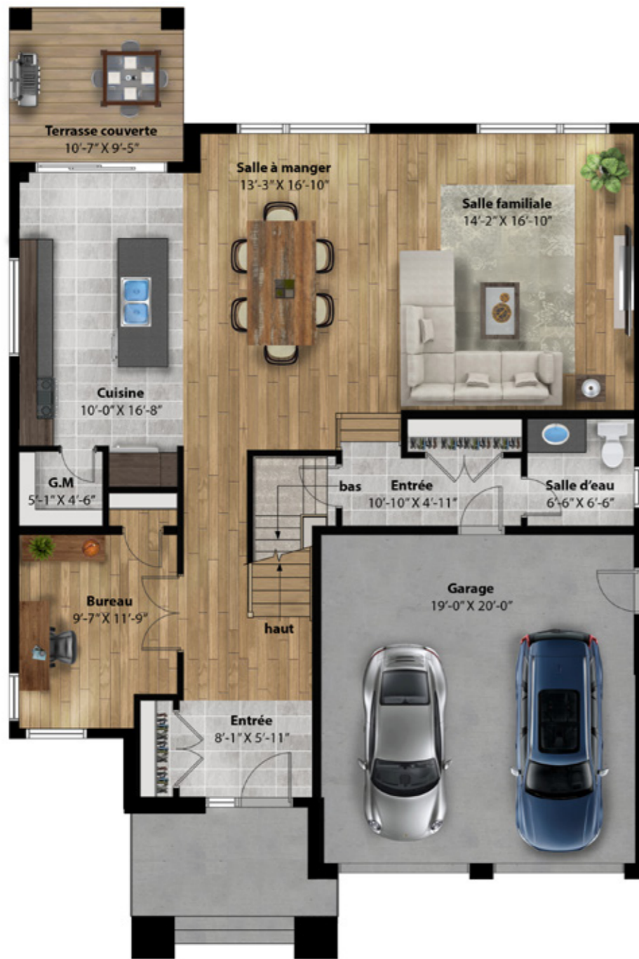
GROUND FLOOR Ground floor area : 1 229 s.f.